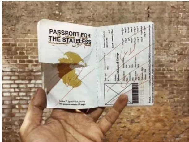
Ahmad Hammoud, Passport for the Stateless , 2016, Color-printed paper booklet, 4.9 × 3.5 in