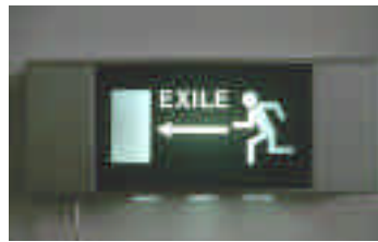
Runa Islam Exile , 1998