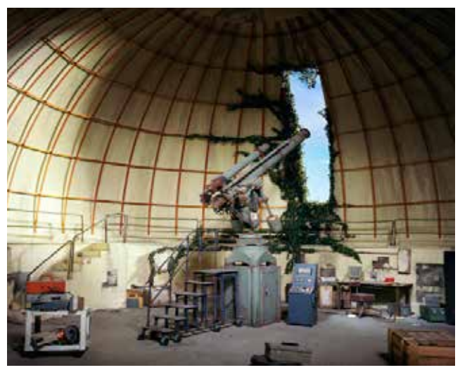
Lori Nix & Kathleen Gerber , Observatory , 2013, Plastic, styrene, foam, wood, miscellaneous materials, 42 \times 27 \times 30 \frac{1}{2} inches

That the world of things can open itself to reveal a secret life—indeed, to reveal a set of actions and hence a narrativity and history outside the given field of perception—is a constant daydream that the miniature presents.<sup>1</sup>