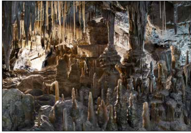
Matthew Albanese, Dark Zone, 2014, C-Print, 21 x 30 inches

Some are educational, depicting historic events, while others are created to raise awareness about issues ranging from poverty to deforestation to isolation. Still others choose to use miniatures to present modern life in a microcosm – a city block, an office interior. The deliberate recreation of those otherwise ordinary scenes forces the viewer to reflect on his or her own daily comings and goings, turning even the mundane into something spectacular and worthy of attention. As artist Joe Fig writes: "Miniatures evoke a feeling of wonder or awe. ... They suspend reality, taking you out of your surroundings and bringing you into a new world."