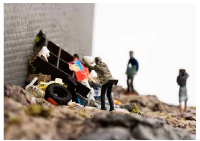
Thomas Doyle, Redoubt, redux, 2011, Mixed media, 8 x 10 inches

perhaps on the west coast, but soon it spread rather all at once, like stars in the night sky, blanketing our continent."4 Dozens of international, national, and regional societies emerged to connect like-minded miniature enthusiasts. and collectors' shows - regularly attracting thousands of attendees – allowed miniaturists to swap ideas and creations.