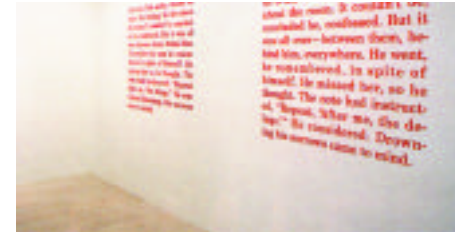
Kay Rosen Oh, Eau , 1989/92 Silkscreen on wall 2 panels each 36 x 36 inches

These works collectively engage in a semiotic activity where at first glance visual and verbal signs collide and press against each other with no seeming syntactic progression. Upon closer inspection, however, each of the artist's process reveals a sustained commitment to two sites of critique: formal and conceptual. Understanding how language relates to speech and signs, each of the artists in Errant Gestures in turn engages their formal medium with an aesthetic language. By doing so, a doubling occurs, in which the artist grafts one form of language onto another to produce a conceptual language, an interstitial site, through which visual art opens up traditional aesthetic categories, but also underscores the inherent ambiguities and slipperiness in language.