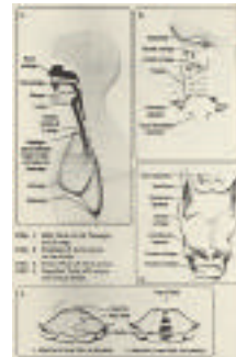
Theresa Hak Kyung Cha image from her book Dictee (New York: Tanam Press 1982)

In Theresa Hak Kyung Cha's video Mouth to Mouth , an or- rice appears like a void, attempting to enunciate the vowels of the Korean alphabet. What follows is a sound- track of static, running water, and birds singing that block mediation and articulation. The disjunctive sounds and the blizzard of video snow that almost threat- en to efface the disembodied mouth, coalesce into an uncanny layering that heightens one's desire to look, listen, and speak.