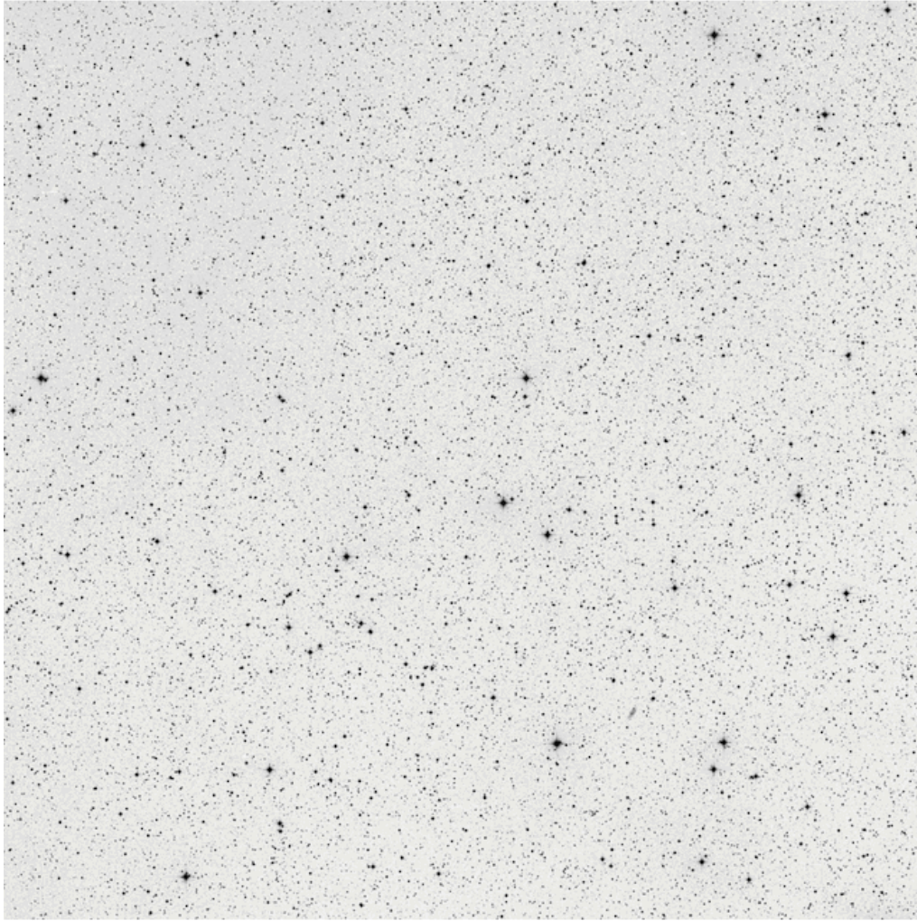
NGS-POSS1 Plate E-161 showing NGC-5792, a spiral galaxy, observed 27 Apr 1957, 00h44 – 01h40

This grandeur of such insignificance is, I suppose, as close as I can get these days to spiritual sentiment. As a child I stared up at the ceiling of my church, a vaulted blue expanse decorated with gold stars, and felt securely situated in an ornately rendered cosmos. God hovered up there over all of us and we knelt below; we had a role in a comprehensible story and were contained within a universe that was geographically legible and soothingly finite. The sky atlas suggests no such arrangement. These photos provide no evidence of hierarchy or narrative; instead there are stars. More than any mind can fully see or imagine; more, I'm sure, than any god might create. The immensity of it all inspires slack-jawed wonderment and my own less-ness in its midst is indeed cause for an almost holy kind of laughter.