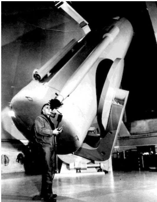
Edwin Hubble at Palomar Observatory's 48-in. Oschin Schmidt telescope, c. 1948 (click to enlarge)

"Billions and billions of stars." Carl Sagan's awestruck if indeterminate census of the universe became a comic catchphrase in the wake of his 1980s PBS series Cosmos . Johnny Carson would intone the line, exaggerating the astrophysicist's sing-songish repetition of billions and we'd laugh. Not because Sagan's estimate was so low (estimates currently put the figure at between 10 sextillion and 1 septillion), but in part because the mere idea of billions of suns and consequent solar systems like our own is a patently impossible notion to comprehend. Contemplating god (as a bearded chap on a throne or some vague organizing "force) is water off a duck compared to the mental rearrangements required by the proposition that everyone alive and who has ever lived amounts to nothing more than a mote of cosmic dust. Now that's hilarious.